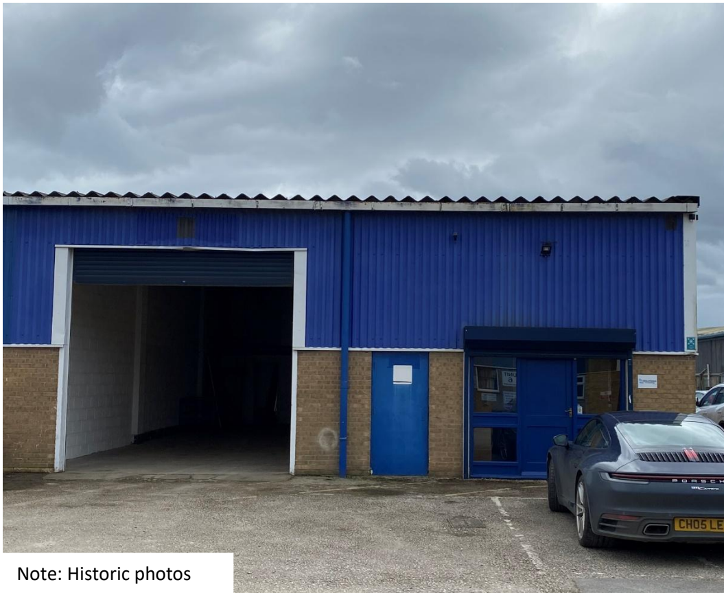
Note: Historic photos